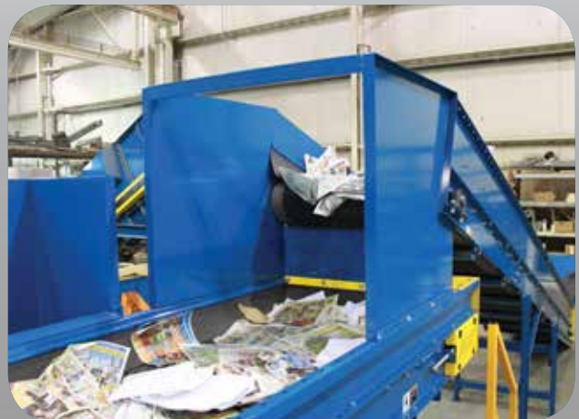
Cleaner & safer work area with transition guides, keeping the materials on the conveyor, not the floor.