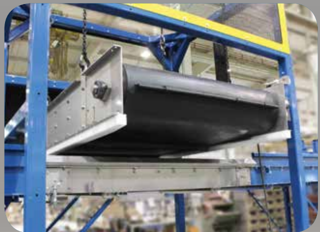
Automate ferrous metal picking with an optional overhead magnetic separator. Can be added to your system right away or later on as your business grows!