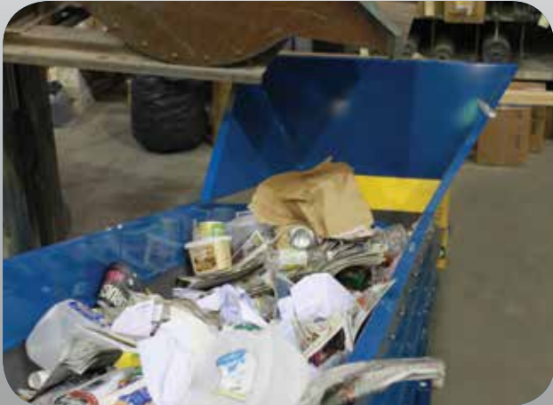
Efficient loading with the right size infeed hopper.