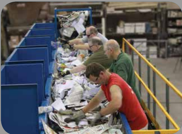
Ergonomically designed sorting stations improve sorter comfort & productivity.